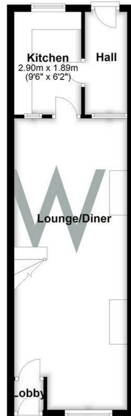
Ground Floor Approx. 35.6 sq. metres (383.1 sq. feet)